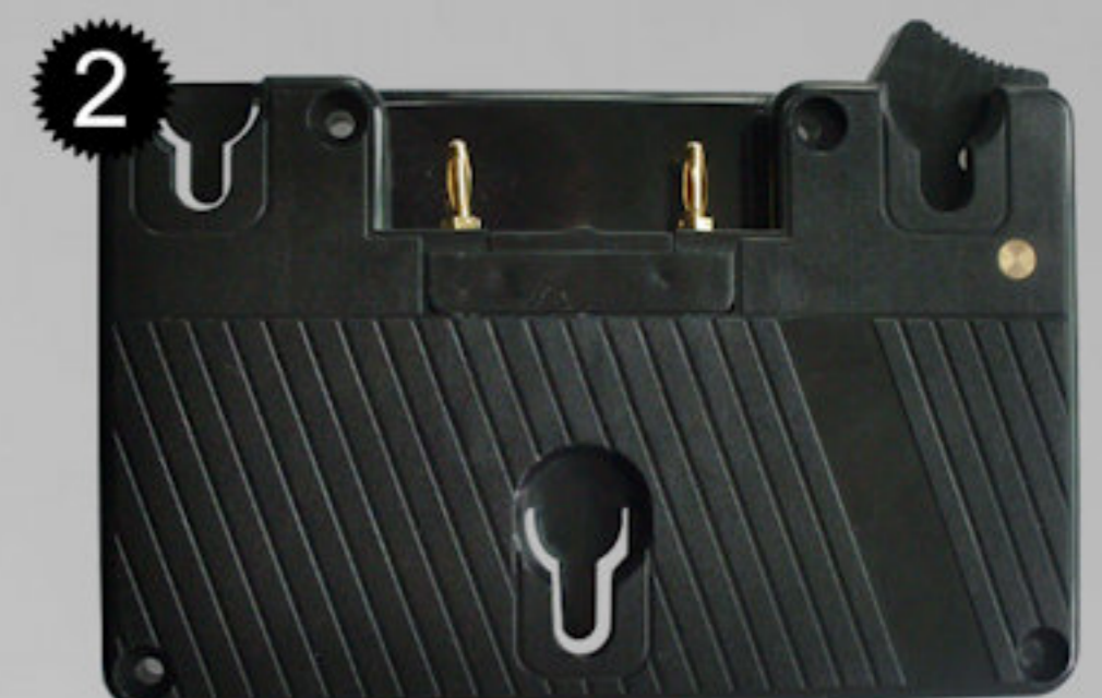
Anton Bauer mount battery plate (optional)